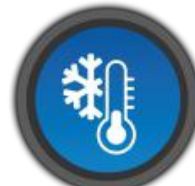
Innovative "cooling" technology to improve reliability and life of the unit