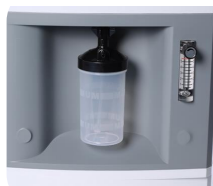
USA imported humidifier 6PSI pressure release