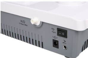
Power Control and Connectivity Hub