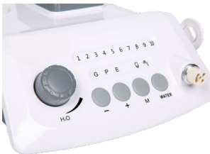
Effortless Power and Function Contro

Shenzhen Falcon and Furix Liffesciences Co. LTD Furix Trade Venture Limited (HK)