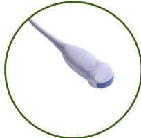
5MHz Micro-convex probe