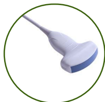
3.5MHz Convex Probe

Chinese/English/Spanish/French/German/Czech/Russian, Other Languages Can Be Expanded According To User Requirements