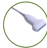
7.5MHz Linear Probe