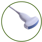
3.5MHz Convex Probe