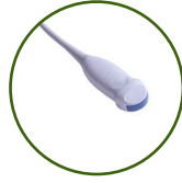
5MHz Micro-convex probe